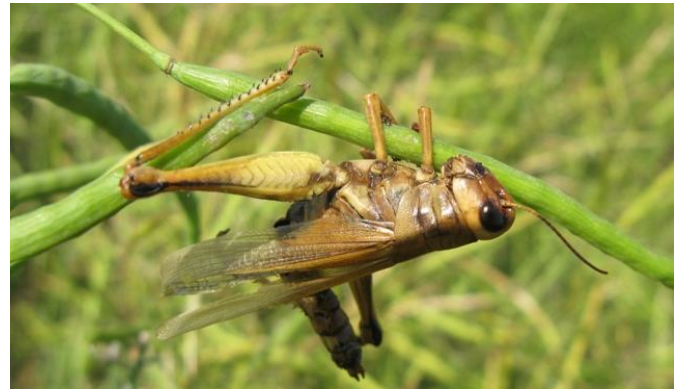
Grasshopper infected with Entomophagus grylli .

Other observations (such as an abundance of grasshopper predators, etc.) which may influence grasshopper populations should also be noted.