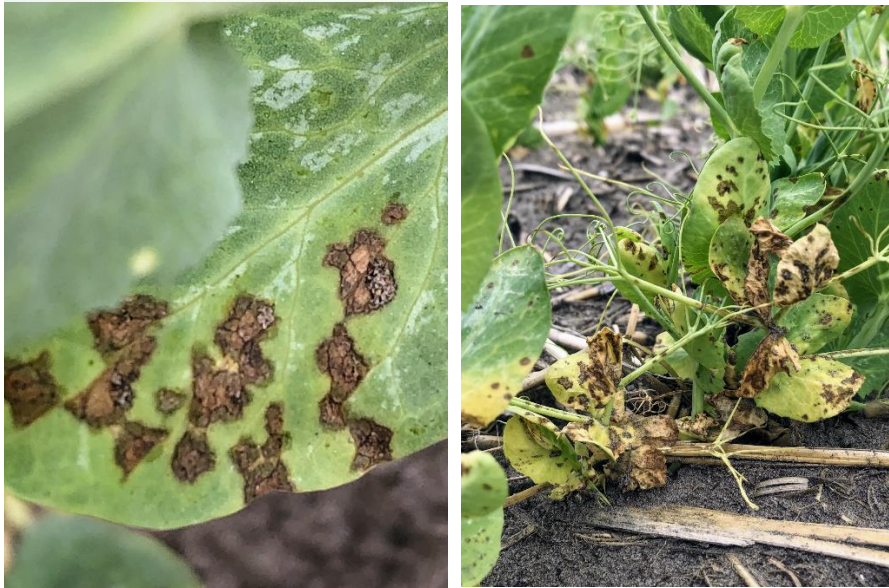
Bacterial blight

In field peas, bacterial blight symptoms are seen in the lowermost leaves, starting as “water-soaked” lesions. These then darken and may have a “greasy” appearance – from bacteria which ooze onto the leaf surfaces and dry there. Symptoms may be mistaken for Mycosphaerella blight (see top and bottom comparison below). The fungal lesions are purplish-brown and angular on leaves, and generally round or elliptical on pods. Again, fungicides are effective against Mycosphaerella but NOT bacterial blight. It is very important to distinguish between the two.