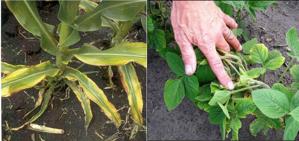
Figures 5-6. Potassium (K) deficiency symptoms in corn and soybeans.