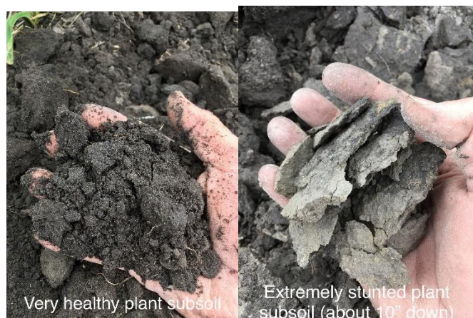
Figures 3-4. Subsoil soil structure at 10” depth under healthy plants (left) and stunted plants (right).

Note the differences in root systems – the healthy plants have not needed to invest as much carbohydrates and energy in developing an effective, downward reaching root system. The stressed plants have had to invest more energy in developing a root system to combat the poor soil conditions. More roots are not always a sign of plant health –the plant may just be expending more energy underground, at the expense of topgrowth.