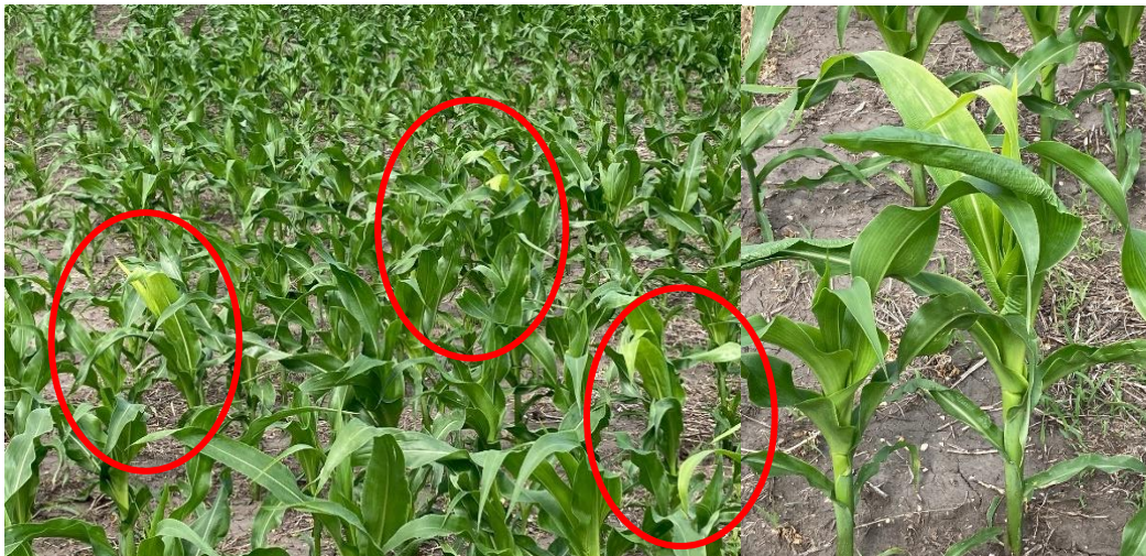
Figure 7. Rapid Growth Syndrome in Manitoba corn.

Sometimes our knee high corn behaves like awkward, fast growing teenagers, and emerges inappropriately in public (Figure 7). This is seen as yellow, chlorotic leaves emerging from a wrapped whorl, noticeably different than the dozens of other plants surrounding it. It is called “Rapid Growth Syndrome”.