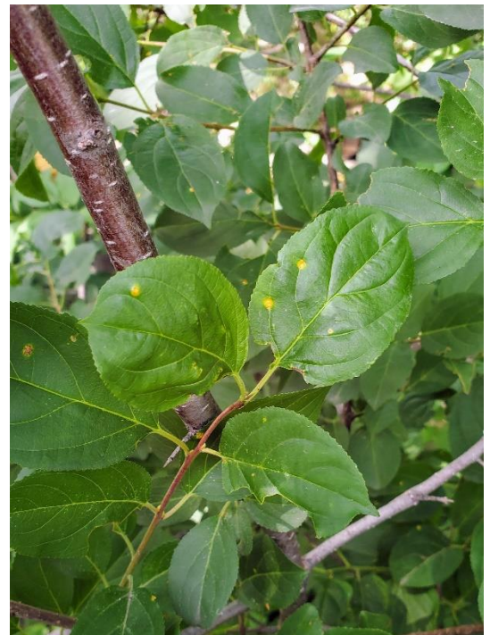
Current stage of pycnial and aecial stages of crown rust on the alternate host – buckthorn.