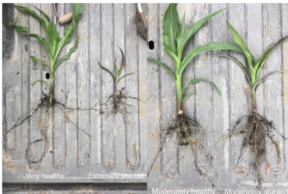
Figure 1 (left): Comparison of healthy corn (left) with extensively developed root system versus a poor, shallow root system on the stunted, purple plant.

Some purple corn is showing up in fields – which may be a symptom of many plant stresses, including phosphorus deficiency (or cold growing conditions, following non-mycorrhizal crops like canola, herbicide residues, compaction, etc). The photos below were submitted from a field following potatoes, where phosphorus deficiency would not be expected. The agronomist (J. Doerksen) scouted with a shovel to reveal the culprit – subsoil compaction and poor soil structure.