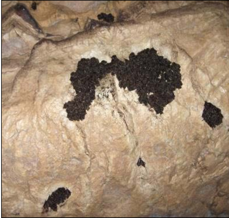
Figure 6 Bat hibernacula

The dark spots are clusters of bats on the roof of the cave shown in figure 5.