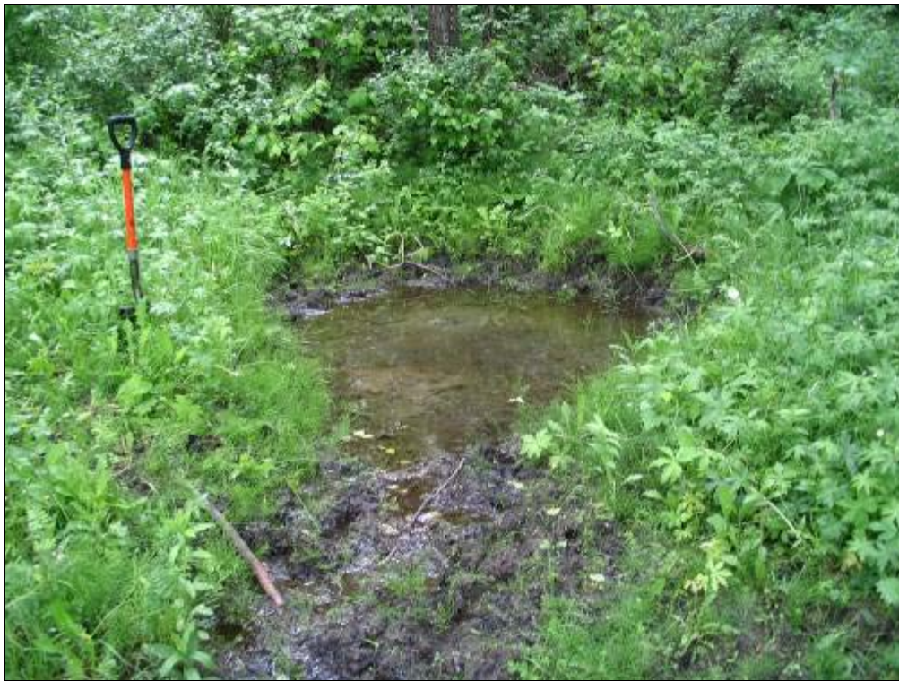
Figure 10 Small mineral lick containing water