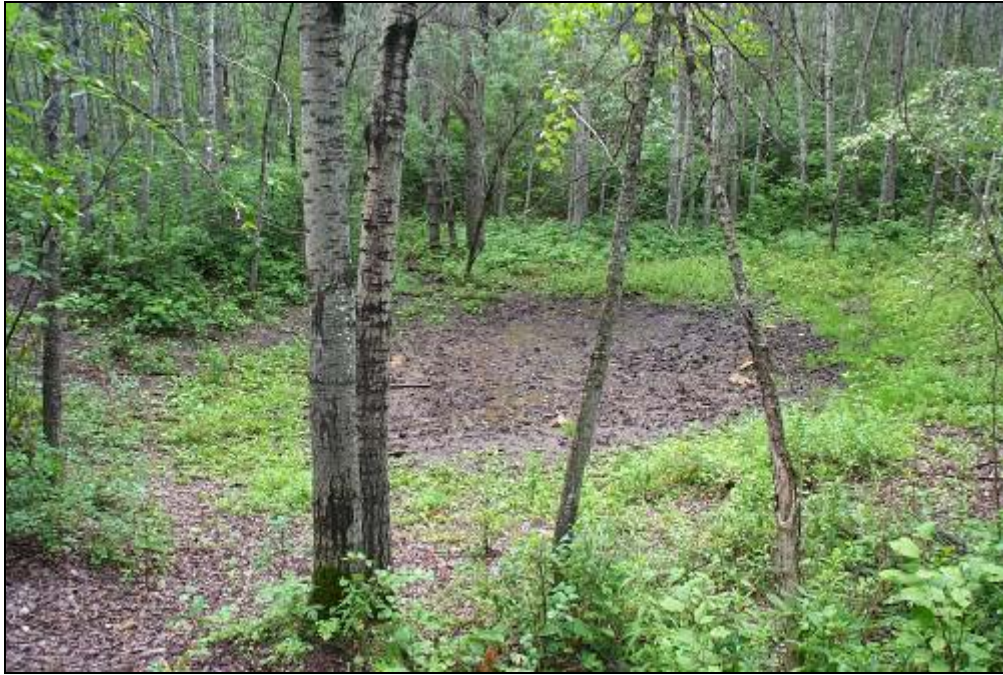
Figure 9 Mineral Lick in treed area