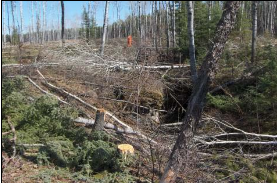
Figure 5 Entrance to bat hibernacula (cave) in northwestern Manitoba, discovered during a winter harvesting operation, and not in a pre-harvest survey. Harvesting was immediately stopped and, when the bats were found, a buffer was placed around the opening.

Unnatural disturbances can create a significant energy demand that may exhaust the limited fat reserves bats need to survive the winter (Asmundson and Larche, 1996). The caves require protection year-round because of the risk of cave-ins by heavy equipment.