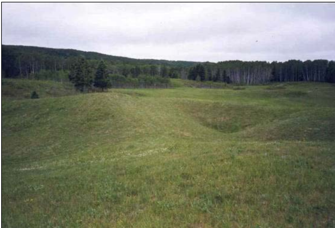
Figure 11 Native Grass Meadow in the Duck Mountains

Within a broader landscape context, these meadows typically form isolated patches in a forested matrix. As a result, they often provide refugia for species that require this type of habitat, either for a portion of their life cycle, or to get nutrition from the associated vegetation (Pedersen and Adams, 1976; Winn, 1976). Native grasslands may have intrinsic value when they supply a rare type of plant community such as fescue prairie. Care should be taken not to destroy this habitat through activities like stockpiling or road construction.