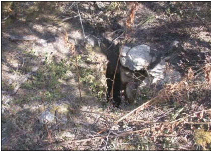
Figure 3 Entrance to snake hibernacula

Snake Hibernacula (Figures 3, 4) – A snake hibernacula is a secure area, usually some sort of cave or den, used by snakes during hibernation. They overwinter in these protected areas below the frost line in large, communal groups. Most hibernacula are dark and secluded to protect the snakes from harm by predators or human disturbances. However, these underground caves and fissures make the area more fragile and, therefore, more vulnerable to cave-ins by heavy equipment. As a result, the snakes require year-round protection from disturbances, particularly in the spring and fall when they are leaving or returning to the hibernacula.