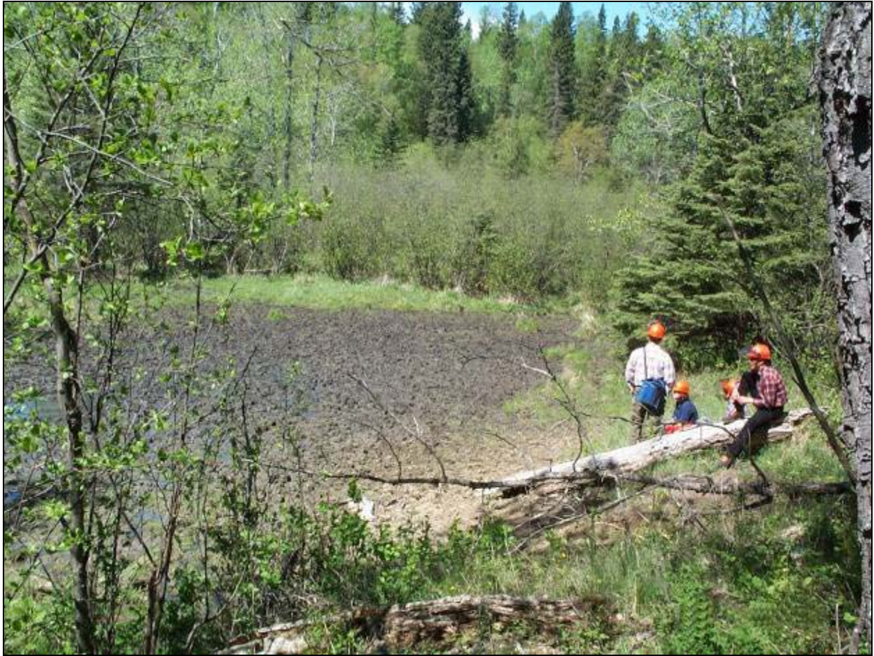
Figure 8 Mineral Lick near Rainy Lake