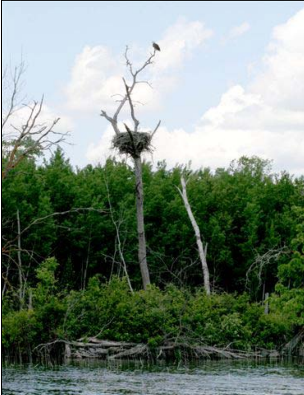
Figure 1 Eagle nest

Eagle and Osprey Nests (Figure 1) – Eagles and ospreys usually nest in tall trees near water. Buffers are required to protect the nest trees, perching trees and feeding areas during the breeding season when the birds are most sensitive to human activity. The Forest Management Guidelines for Riparian Management Areas (2008) do not necessarily identify the full buffer required for eagle, osprey, heron and other active stick nests, when they occur in the riparian zone. Use the guideline that results in the most protection (widest reserve) being applied.