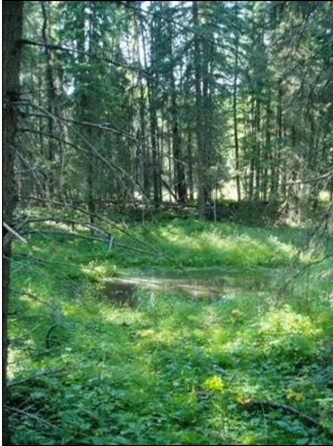
Figure 13 Landscape view of a wallow