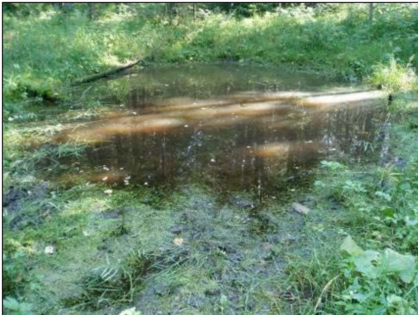
Figure 14 Wallow