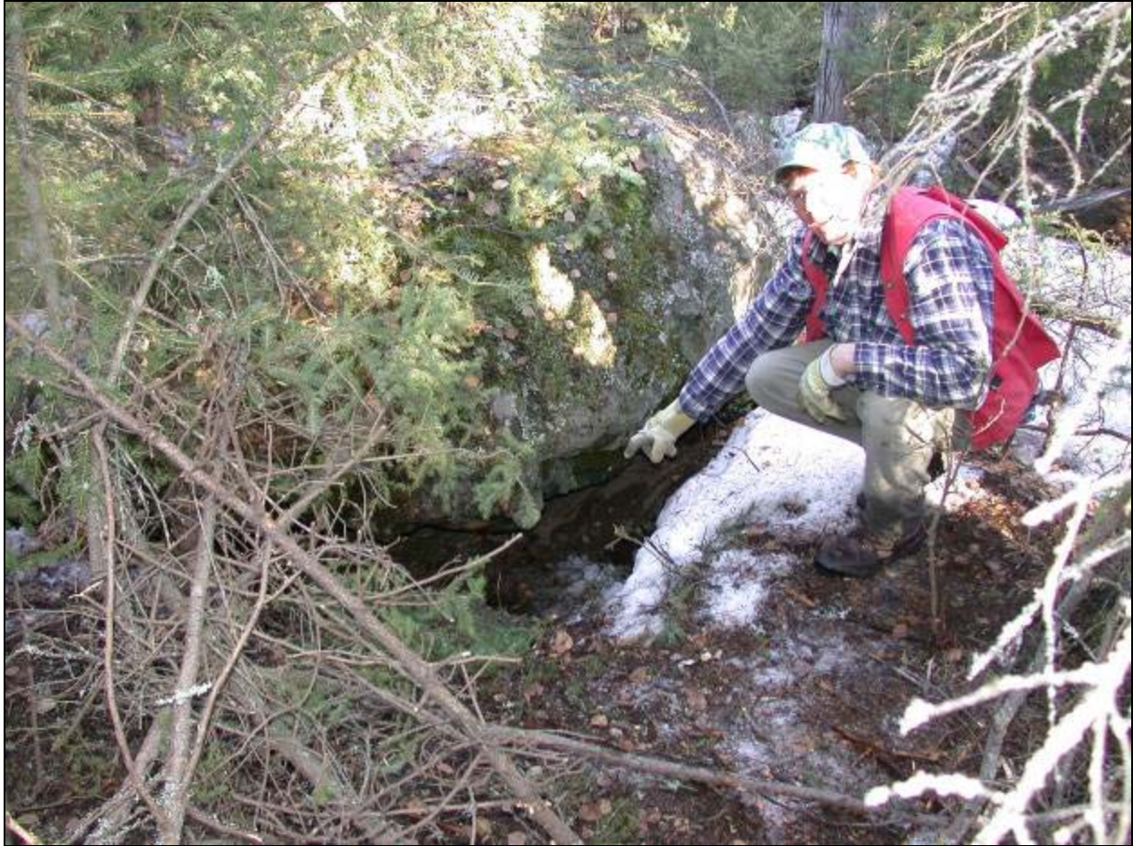
Figure 12 Bear den on the north shore of Athapapuskow Lake

Other Important Wildlife Features – These refer to habitats that are necessary for wildlife species and also affect their future population potential.