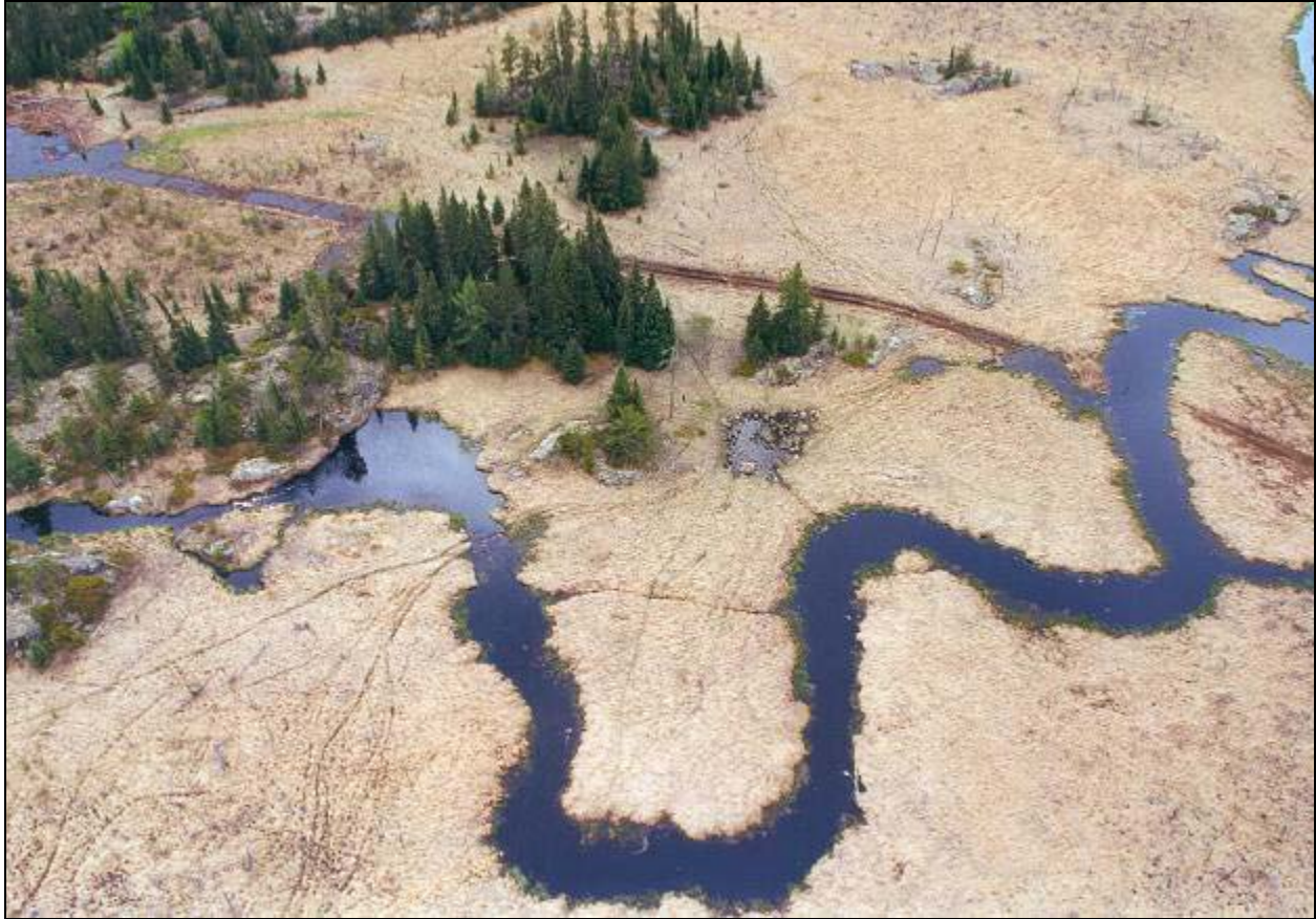
Figure 7 Aerial view of a mineral lick, showing wildlife trails

Mineral licks are not always in forested areas. The mineral lick pictured above is not a potential logging site, but shows wildlife trails leading to the mineral lick. The winter road, seen in the photo, was originally the proposed location for a summer road. However, the summer road was relocated because of the mineral lick.