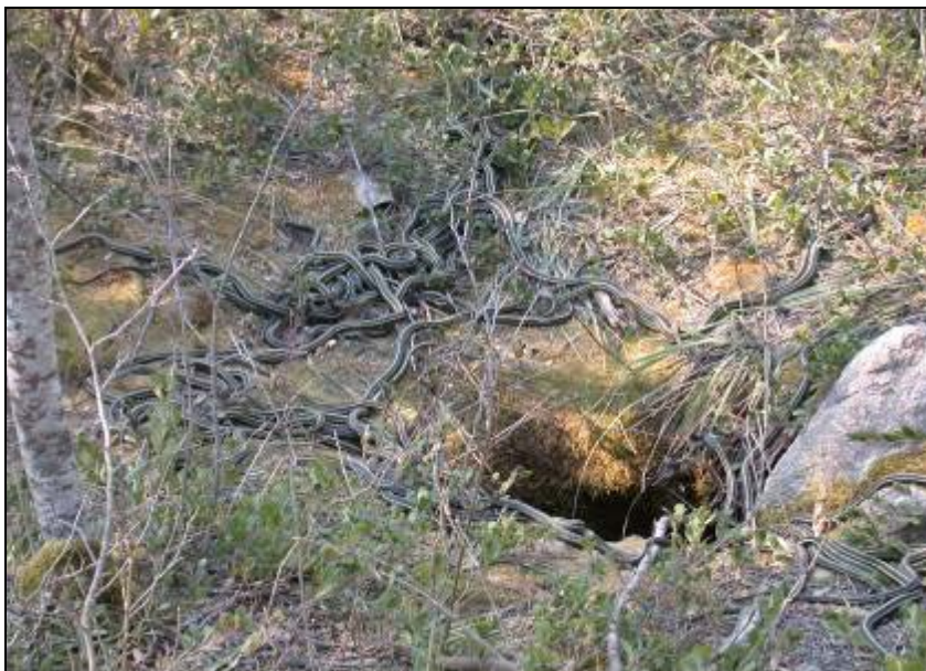
Figure 4 Snakes at the entrance to the hibernacula